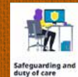
Safeguarding and duty of care

Whether its literacy or subject specific SEND courses, there is a wide range of options to help develop and improve your practice and understanding.