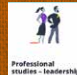
Professional studies - leadership